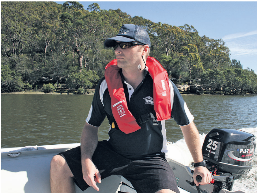
A simple tiller steer arrangement that has tension adjustment to allow the skipper to control the craft better.

There were two of us in the boat (I got out to take pictures) and away we went with no plans, just to run around get a feel for the motor and boat and see this amazingly scenic river.