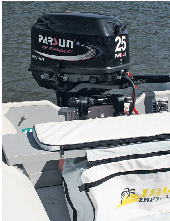
Removable for transport, the 52kg Parsun 25hp can be managed by one person, however two people would make it a very simple operation.