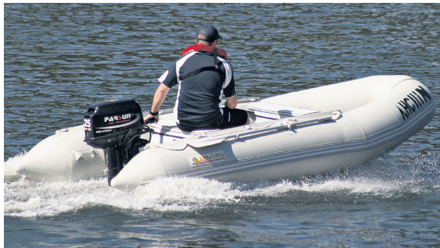
On the small Island Inflatable, the 25hp 2-stroke had no dramas getting the rig moving at speed.

Check www.islandinflatables.com.au for your local dealer or contact Parsun direct on 02 9532 0002.